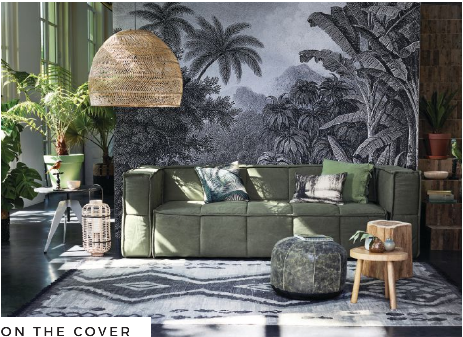
ON THE COVER

The HK Living scene on our cover this month showcases several looks we included in our trend reports in this issue, including the Large Wicker hanging lamp, Wall Chart XXL Palms, and the Army Green couch and leather pouf. For information on all products, visit www.hklivingusa.com .